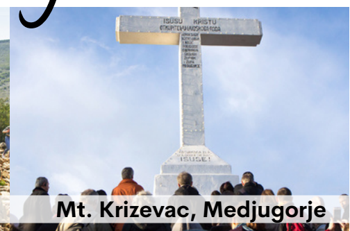
Mt. Krizevac, Medjugorje