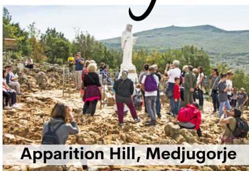
Apparition Hill, Medjugorje