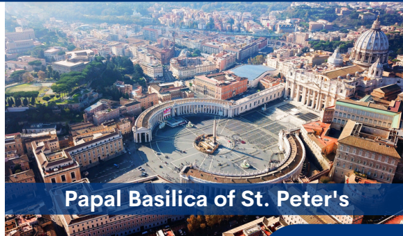
Papal Basilica of St. Peter's