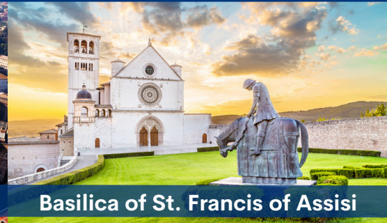
Basilica of St. Francis of Assisi