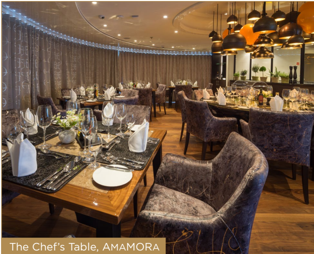
The Chef's Table, AMAMORA

AmaWaterways' twin balcony ships represent some of the newest vessels in our fleet. Heated pools with a swim-up bar provide a tranquil environment for viewing stunning mountains and spired skylines. Plus, spacious staterooms afford guests comfort and privacy to rejuvenate while still experiencing the magnificent scenery.