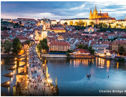
Charles Bridge &