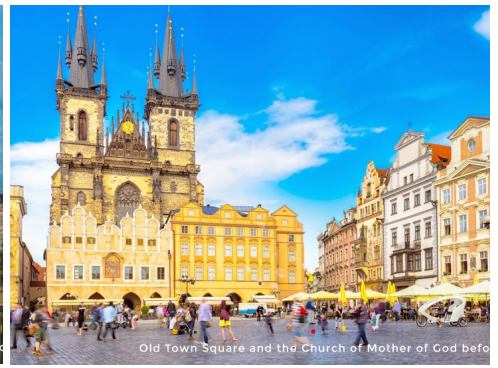
Old Town Square and the Church of Mother of God before Týn