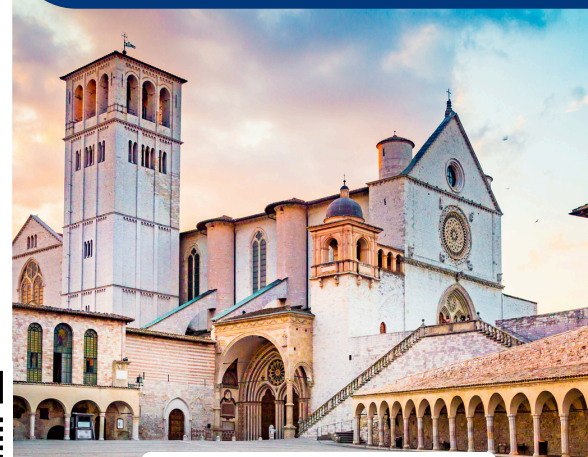
Basilica of St. Francis, Assisi

silvia@206tours.com cara@206tours.com dominic@206tours.com (800) 206-8687