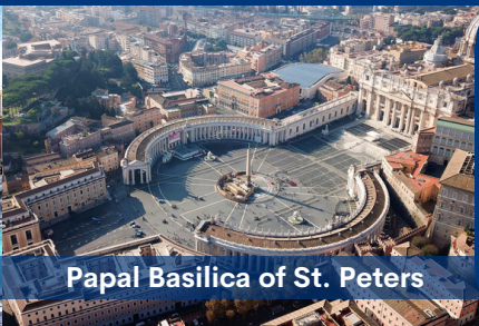
Papal Basilica of St. Peters